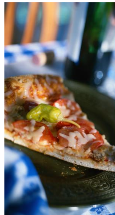
Support the Friends of Camp Kenan Campership program in the most delicious way possible— with pizza!