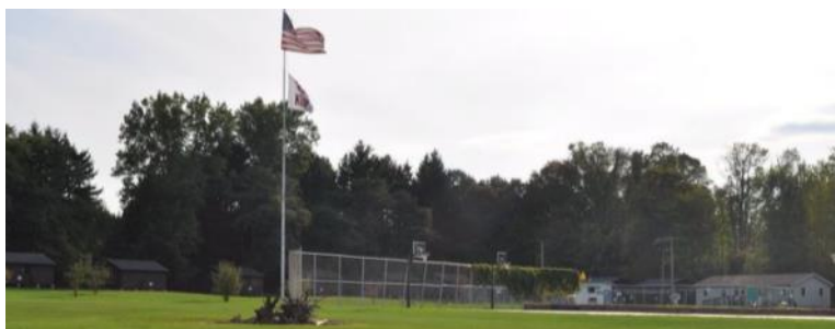
Come back to Camp Kenan for Goosestock and have a great time!