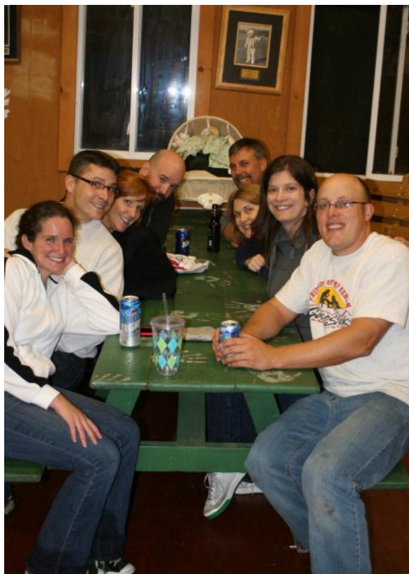
Enjoying OD at GS2011—this could be you in 2012!

This year's Olympiad themed Goosestock is shaping into an even more exciting weekend then in the previous years! Stay tuned to Facebook and the Friends of Camp Kenan website for schedules and updates as we get closer to the date.