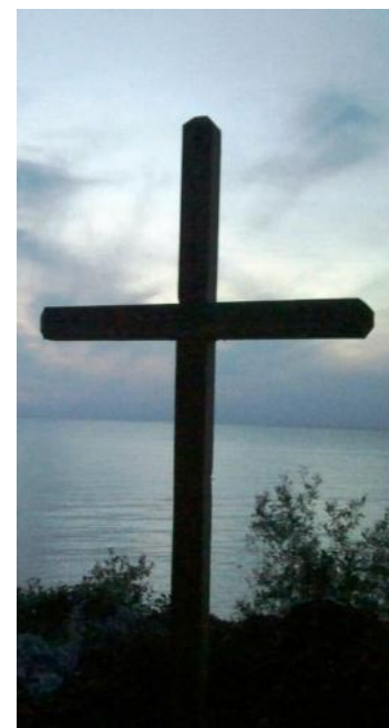
Looking out at Lake Ontario from the Michael Tobin Memorial Chapel at Camp Kenan.